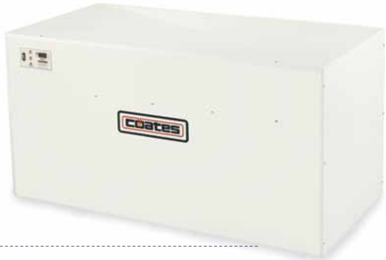
PHS-20 THREE PHASE

All electrical components are easily accessible under the conveniently hinged cover. Terminal blocks are provided for simplified power supply wiring.